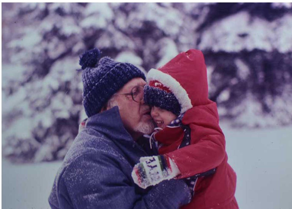
Precious moment between a grandfather and his granddaughter.

The photos we save are reminders of life's most cherished moments. They tell our stories of our family, our relationships, our culture, our faith, and especially our love. They are inexpressibly important, not just for us but for future generations. They should be protected.